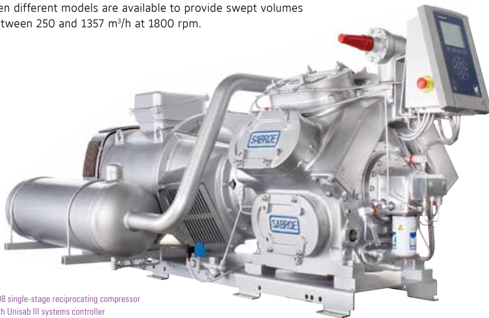
SMC 108 single-stage reciprocating compressor unit with Unisab III systems controller

Fifteen different models are available to provide swept volumes of between 250 and 1357 m 3 /h at 1800 rpm.