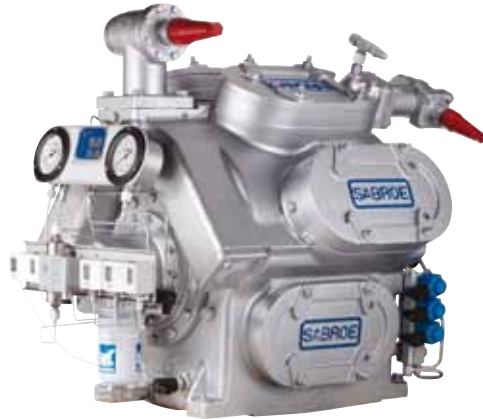
SMC 108 single-stage reciprocating compressor block with gauges